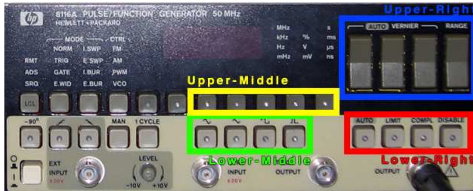
Figure 3: HP 8116A Front Panel